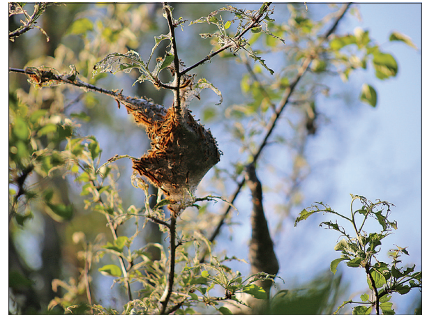
Tent caterpillars on the march on an apple tree branch, left, and others still in webs in a tree with already munched leaves.