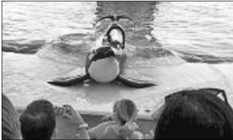
Scene from Blackfish , which shows at ArtSpring Sept. 18.

"Unlike Cove , however, Blackfish spares the audience any grizzly death-scenes," says Jason Cressey,