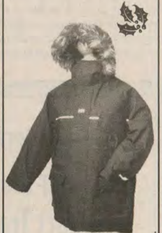
HELLY HANSEN kids outdoorwear

We offer a great selection of quality made logo and non-logo items for Holiday Gift Giving Made in Canada