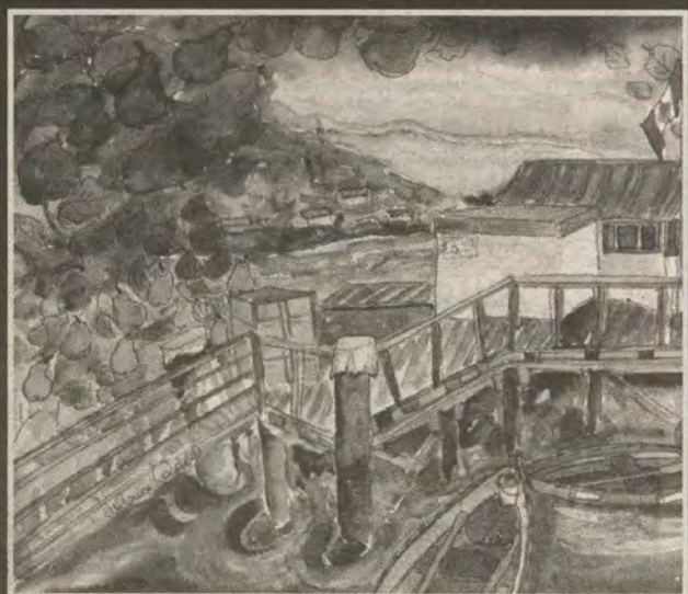
"Sea Pears" Limited Edition Available

"Long fascinated with the prolific pear tree shading the board walk in front of the Coast Guard Cottage. I wanted to capture an essence of SSI and decided on a play of words; the pair of rowboats resting, reflecting and sea pears blossoming above" Jill