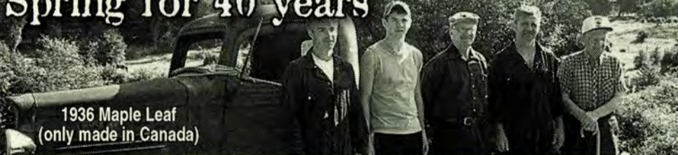
1936 Maple Leaf (only made in Canada)