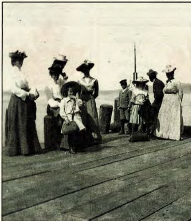
Waiting on Beaver Point Wharf, circa 1900.

non-native house in Ganges Harbour in November of 1859. They stayed less than a year.