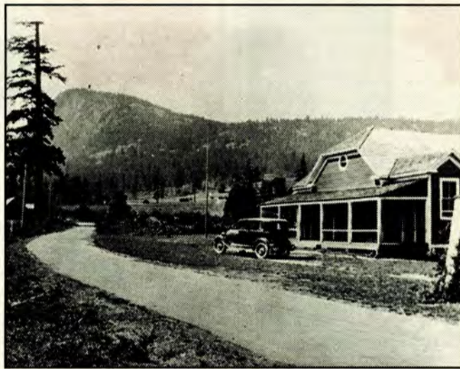
Burgoyne Bay School in the 1930s.