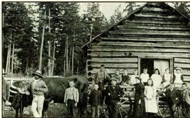
The island's first school was opened at Central in 1861.