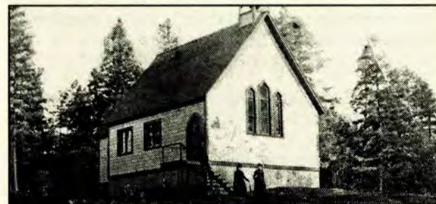
St. Mark's Anglican Church, North End Road, circa 1887.

for two replacement buses was announced just last week.