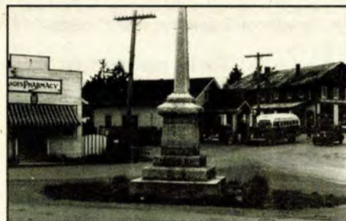
Above: the Cenotaph in the centre of Ganges in 1948.

131. The Islands Trust came into existence in 1974 with a mandate to "preserve and protect" the islands.