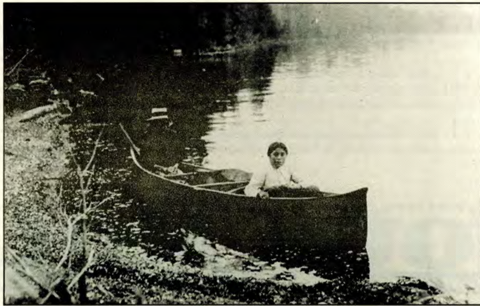
Native couple visit Fernwood circa 1910.