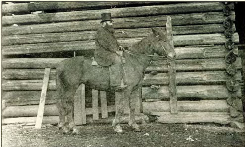
'The Squire of Salt Spring' — Harry Bullock.

93. The earliest volcanic rocks of Salt Spring were laid down in the South Pacific Ocean 400 million years ago.