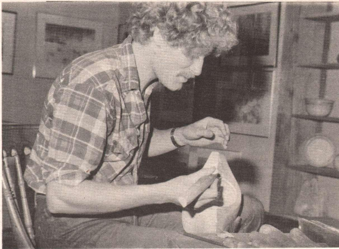
Driftwood