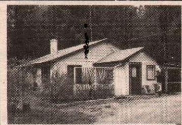
on 3 acres—$59,500.

.55 acre at the end of Churchill Rd. Excellent southern exposure, easy access to ocean. Level property, mainly treed with some landscaping. Short walk to town, quiet dead-end road. 3 bedroom home, fireplace, wall-to-wall carpets, basement area for storage, small cabin ideal for guests. Asking $175,000.