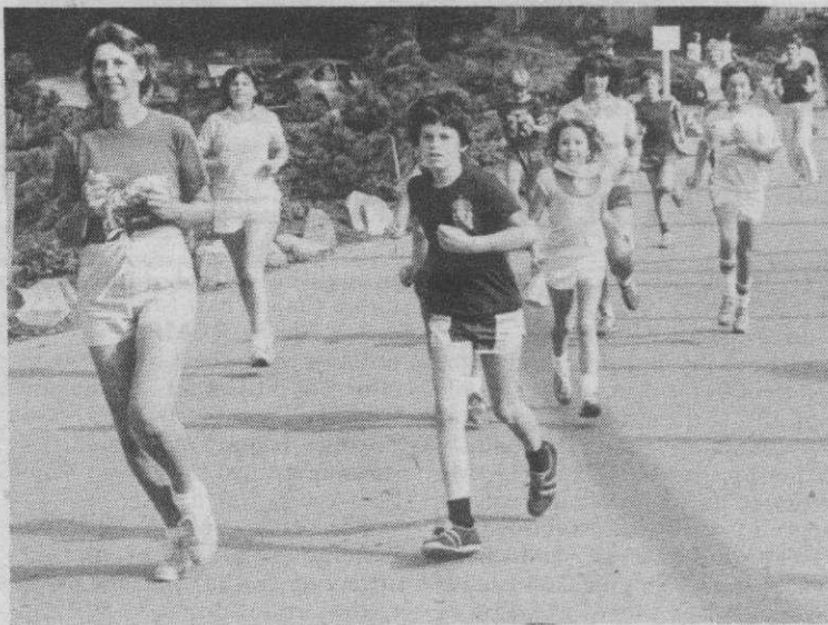
Driftwood photo by Alice Richards

The ministry had set a projected enrolment of 464 students and 81 kindergarten pupils as a combined total for both schools. The preliminary figures show that 499 students, with 76 in kindergarten, are attending the Salt Spring schools.