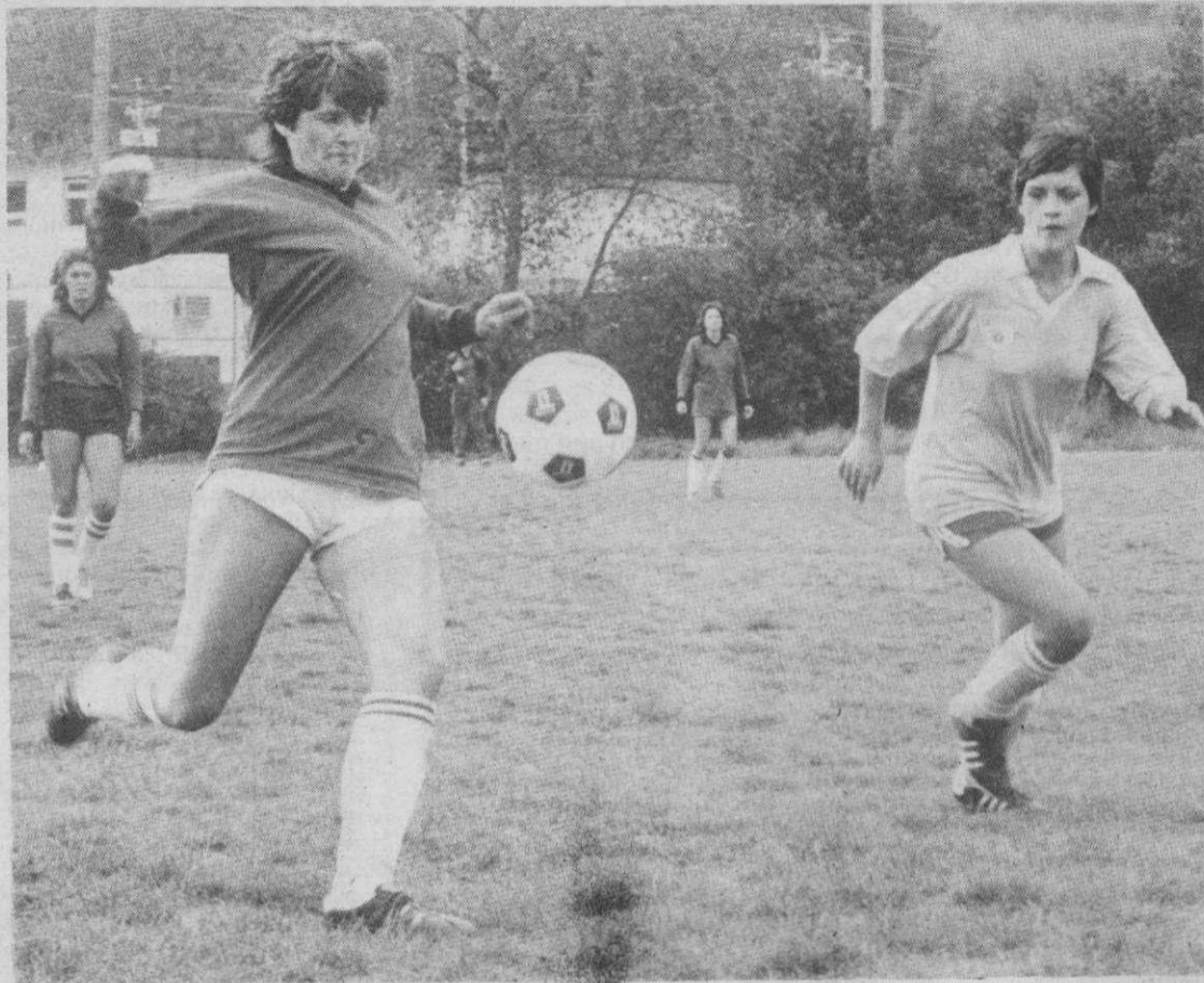
Driftwood photo by Alice Richards

The remainder of our funds are raised by donations from businesses, service clubs and individuals. Sponsorships run from $300 for an off-island team to $100 for intra-island teams to a straight donation to our club. If you are interested in becoming a sponsor please call me.