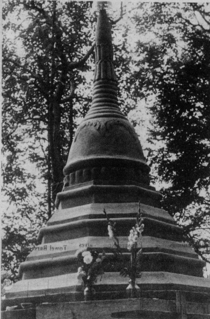
New Crystal Mountain Pagoda at Galiano