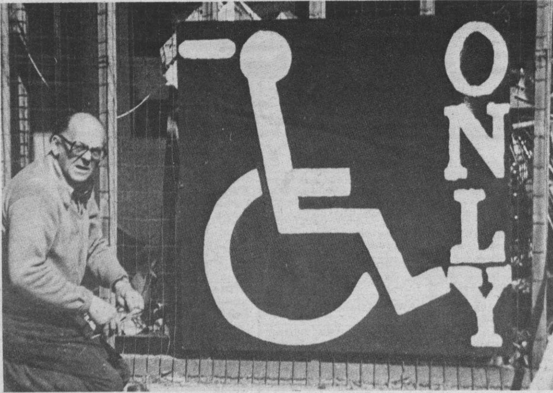
Driftwood photo by Bill Webster