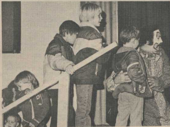
Children line up to see Santa Claus at Ganges Activity Centre Saturday evening.

On Sunday morning the Christmas Ship, the 38-ft. Discovery , left for the Outer Gulf Islands, returning to Bellingham Sunday evening.