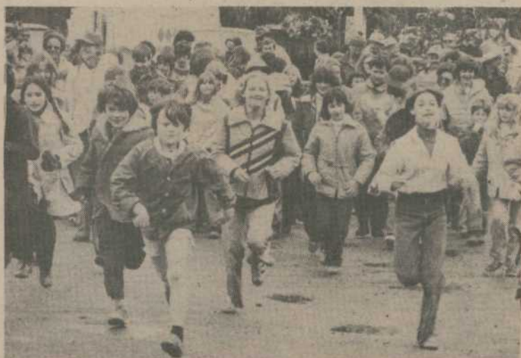
The Salt Spring Lions Walkathon is always a popular event.