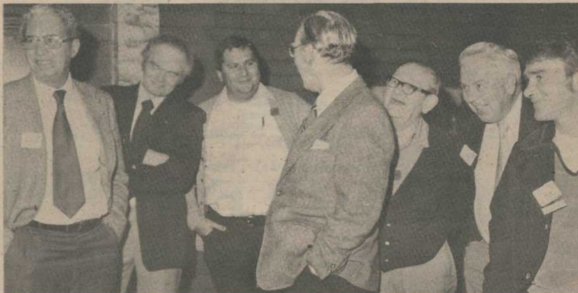
Salt Spring Rotary Club members enjoyed watching a demonstration of the Ganges RCMP detachment's breathalyzer machine.