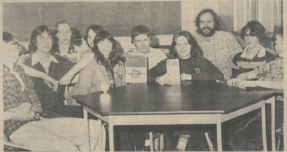
Students display some of the souvenirs from their field trip.

Bergstrom makes no apology, either, for the two days of skiing the students got in.