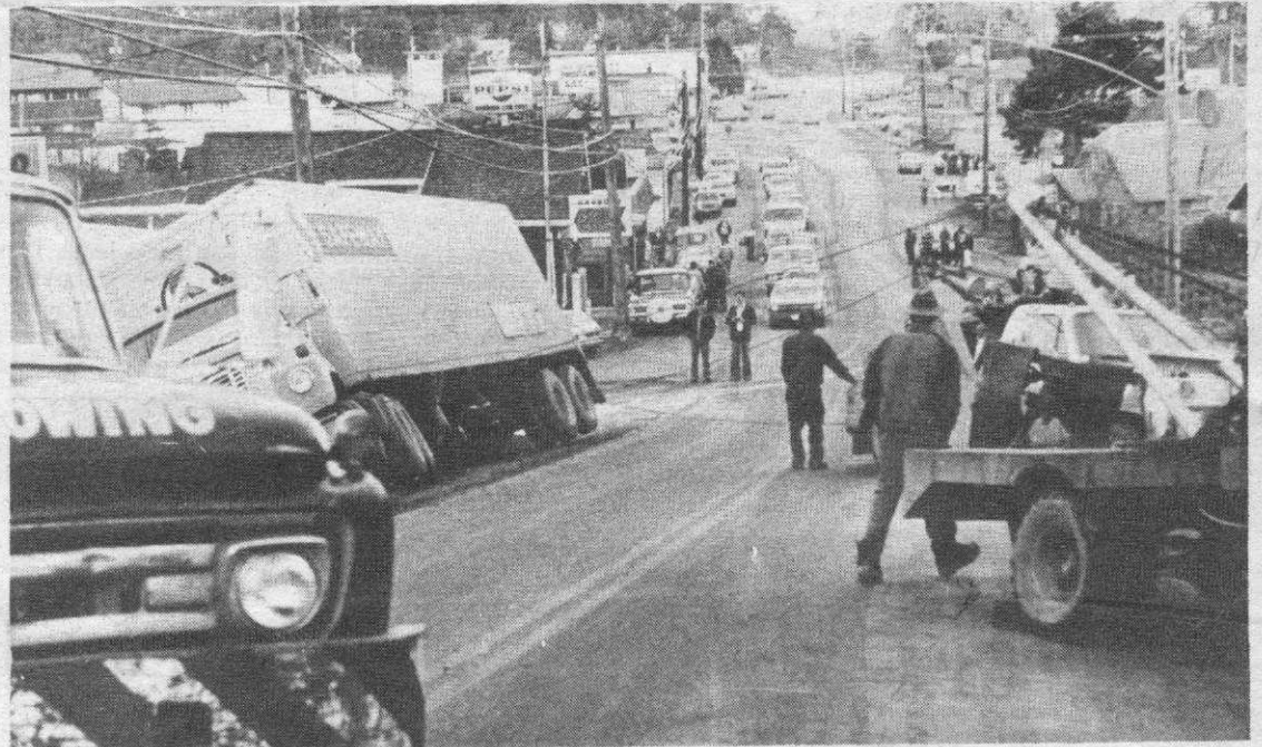
Truck slides off road at Ganges

The gasoline tax is intended to combat the deficit on transit services in the main urban centres of the province. Urban Transit Auth-