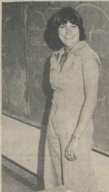
Everything starts here: with teacher, or . . . debates and exchanges with the school trustees before the job went ahead.

When parents were called together to challenge plans to provide no changing rooms and other facilities, they challenged the value of a new school at the north end of Salt Spring Island. There were long