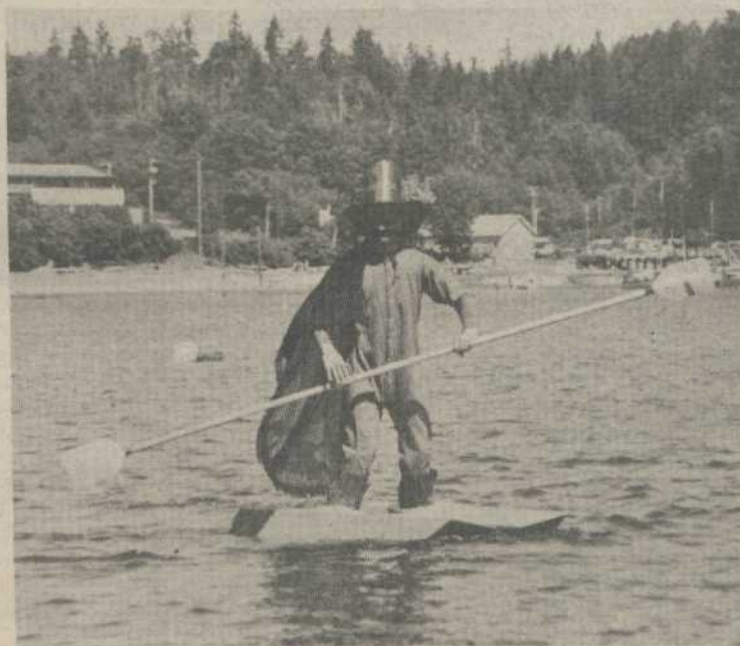
Sea Capers... Continued from page one.