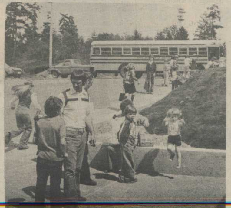
. . . but it all begins and ends with the school bus here at school!