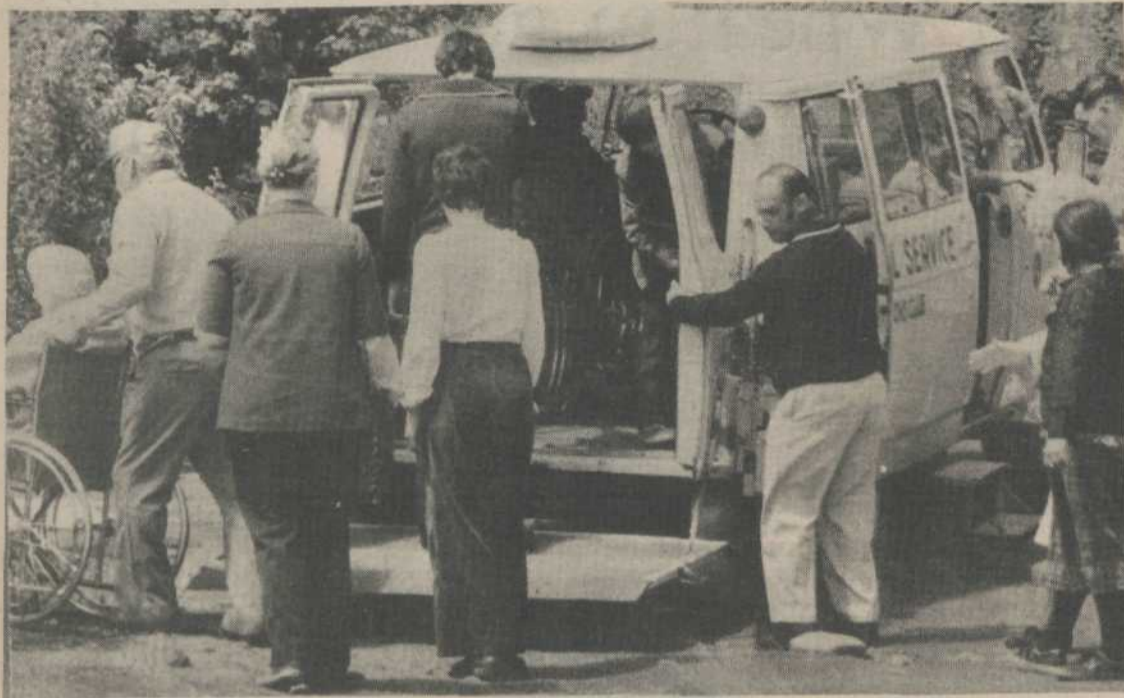
It was the first time for residents of Greenwoods. On Monday they went to Fulford Inn for lunch. Volunteers placed cars at their disposal and they were driven to the south end of Salt Spring Island. Picture shows some of the guests disembarking from the Lions Bunny Bus, which brought people in wheelchairs.

'Environmentally, aesthetically desirable'