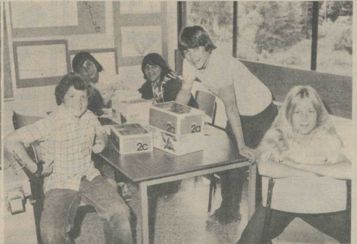
. . . or the students hamming it up. . . .