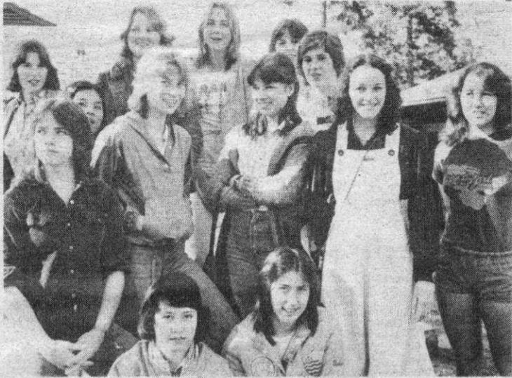
Pictured here is Gulf Islands Secondary School's Junior Girls Basketball team before their game