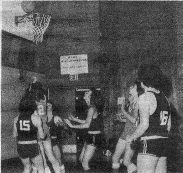
Here's some of the action that took place in the Gulf Islands Secondary School gym Friday evening when the school's Junior Boys