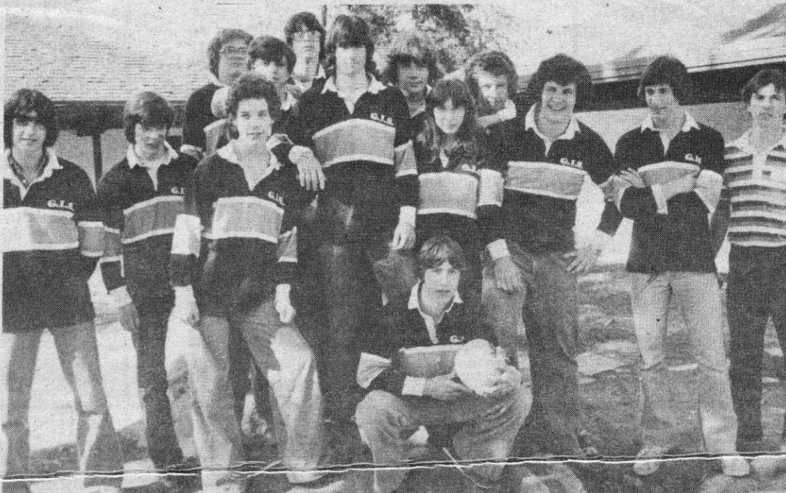
A relatively new team at Gulf Islands Secondary School is the G.I. Islanders rugby team. The boys have played two games so far. They lost both games, but hopes for improvement are high.