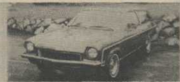
1973 VEGA ESTATE WAGON 4 cyl., auto., radio $1275