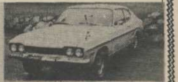
1972 FORD CAPRI 4 cyl, 4 spd., radio $1675