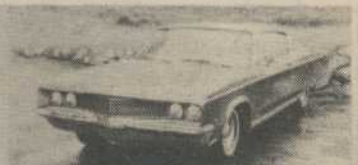
1968 CHRYSLER NEWPORT CUSTOM V/8, auto., P.S., P.B., radio $1175