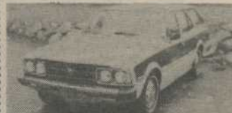
1974 TOYOTA CORONA WGN 4 cyl., 4 spd., radio $2975