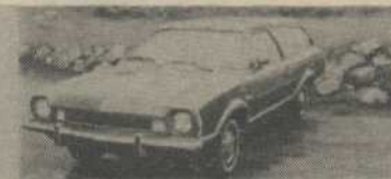
1973 FORD PINTO SQUIRE WGN 4 cyl., auto., radio $2275