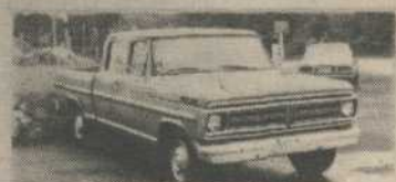
1972 FORD F250 CREW CAB V/8, auto., radio $1675