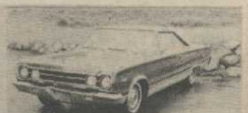
1967 PLYMOUTH SPORT SATELLITE 2 dr. H.T., V/8, auto. $675