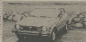
1975 HONDA CIVIC 4 cyl., 4 spd., radio $2275