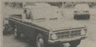
1975 FORD COURIER PICKUP 4 cyl., 4 spd., radio. $2575