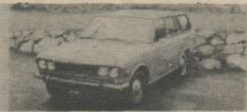
1970 DATSUN 510 WAGON 4 cyl., 4 spd., radio $875