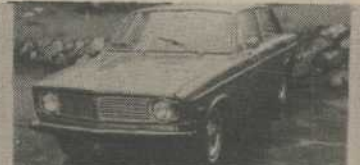
1968 VOLVO 142 4 cyl., 4 spd. $475