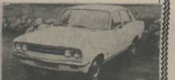
1969 VAUXHALL 4 cyl., auto. $675