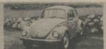
1972 VOLKS BEETLE 4 spd., radio $1375