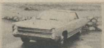
1967 PLYMOUTH FURY III V/8, auto, P.S., P.B., radio $775