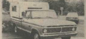
1973 FORD F100 PICKUP V/8, 4 spd., without camper $1775