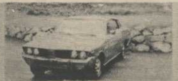
1973 TOYOTA MARK II 6 cyl., 4 spd., radio $2275