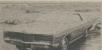
1970 FORD LTD V/8, auto., P.S., P.B., air cond. $1175