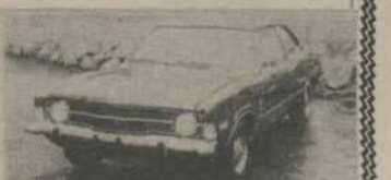
1973 FORD CORTINA 4 cyl., 4 spd., radio $1475