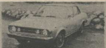
1974 PLYMOUTH CRICKET 4 cyl., 4 spd., radio $2075