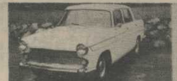
1966 AUSTIN CAMBRIDGE 4 cyl., auto. $675