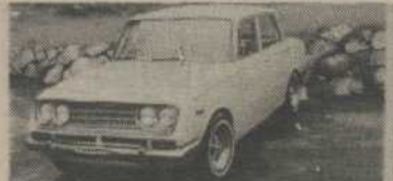
1967 TOYOTA CORONA 4 cyl., 4 spd., radio, mags. $475