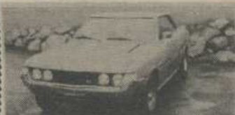
1973 TOYOTA CELICA 4 cyl., 4 spd., radio, mags. $2175