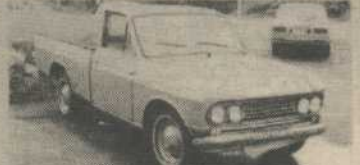
1968 DATSUN PICKUP 4 cyl., 4 spd. $475