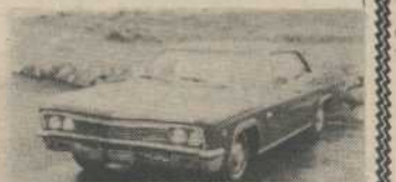
1966 CHEV CAPRICE V/8, auto., radio P.S., P.B. $575