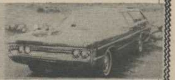
1970 PLYMOUTH WAGON V/8, auto., radio $875