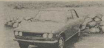
1972 DATSUN 510 4 cyl., auto., radio $1475