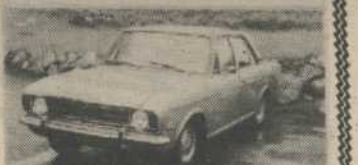
1971 FORD CORTINA 4 cyl., auto. $575