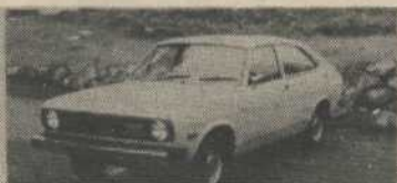
1975 AUSTIN MARINA 4 cyl., auto., radio $2075