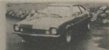
1971 FORD PINTO 4 cyl., 4 spd., mags. $1175