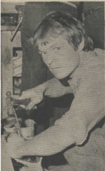
t removes the drive shaft from a Johnson.