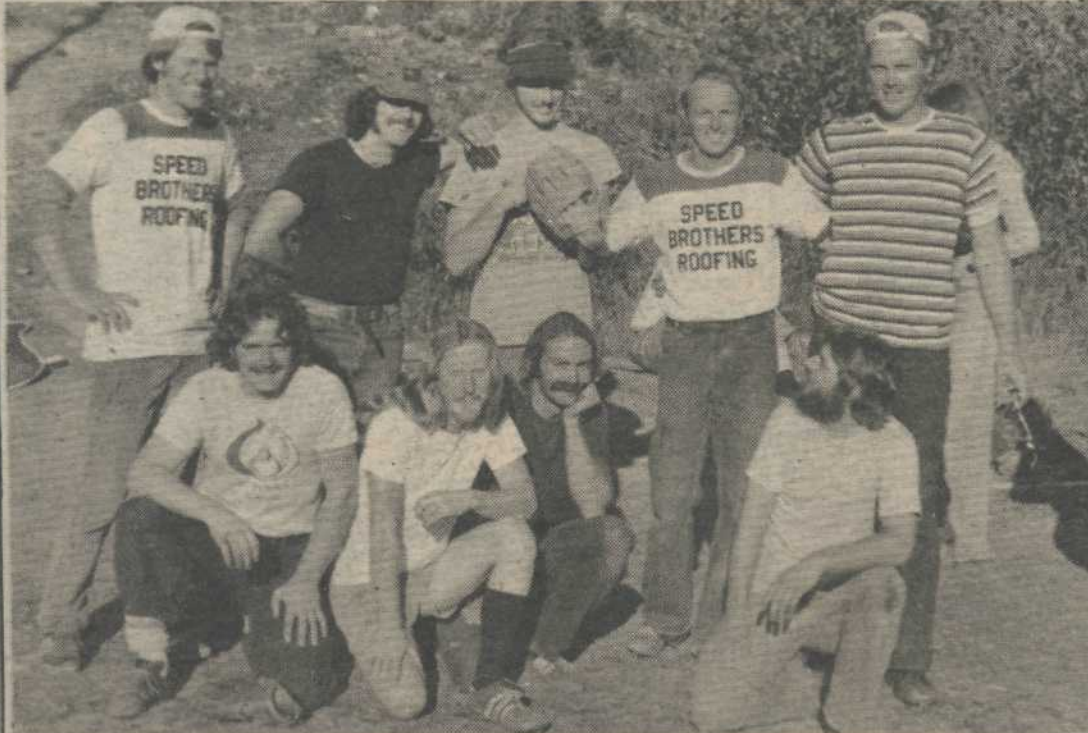
Salt Spring Cablevision softball team, above, won the playoff championship when they defeated Kitchen Falling Contractors 14-2. Fulford Salties, below, took the Labour Day Championship when they beat Cablevision by a score of 9-5.