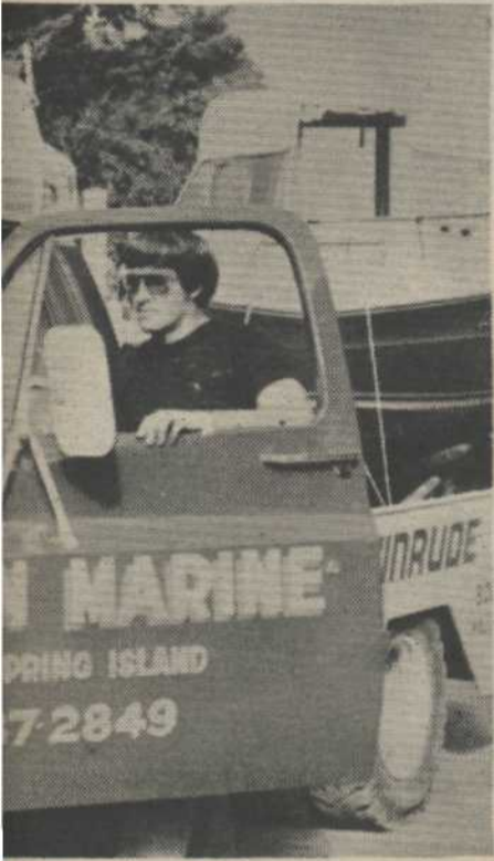
truck to move a boat.

He began working in the mechanical field in 1962 in Ontario.