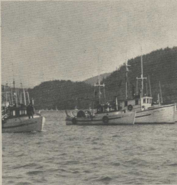
Here are some gillnetters of the Port Edward fishing fleet.