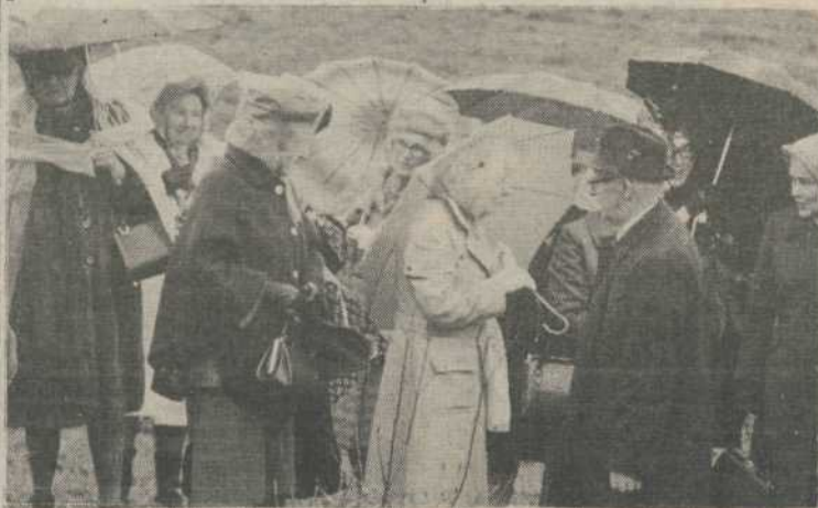
Members of the Vancouver Island Media Club at Sunday's ceremony which took place in St. Mary's churchyard.

Majority of visitors left by the 2.30 pm ferry and island visitors left the church group with the dishes.