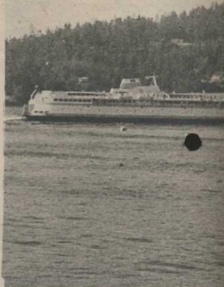
One of the B.C. Ferries

Not very many small boat operators are aware of their responsibilities. Some have