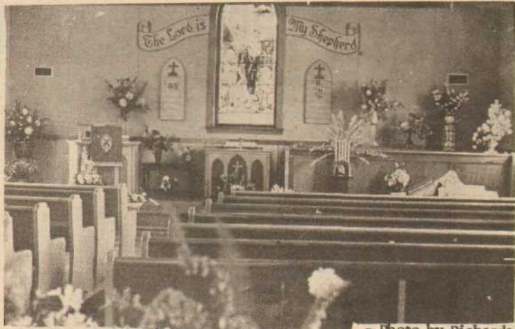
Scene in Ganges United Church during Festival of Flowers.

Next: colour: There were glorious colours to be seen. One recalls delphiniums in St. George's, a bright clematis in St. Mark's, pink paeonies in St. Paul's and a lot of others, especially golden wild broom to which I would have awarded my first prize if it had been in a show. But the only aim was decoration; and if you kept this in the forefront of your mind then you would inevitably have turned to Nature for your model.