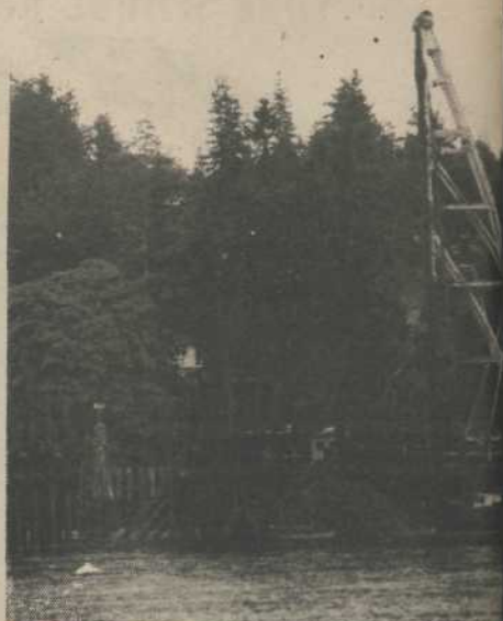
THE CHANGING FACE OF