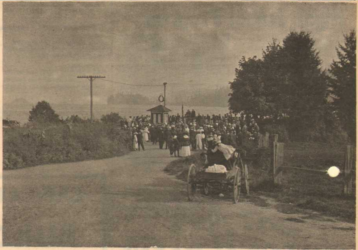
The photographer was in Ganges when he took this picture. He stood outside the Salt Spring Island Trading Company's store and this is what he saw. The old war memorial, now lost after dismantling is seen where