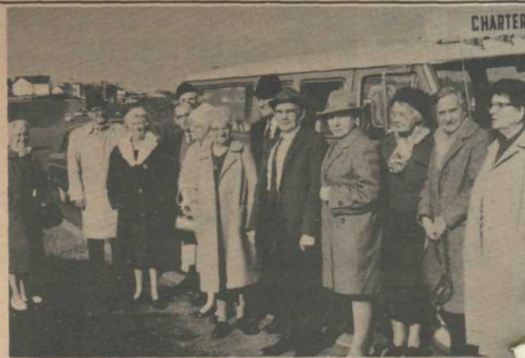
Pensioners recent trip to Victoria on Salt Spring minibus.