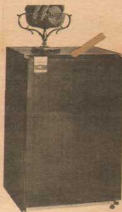
5.5 CU. FT.