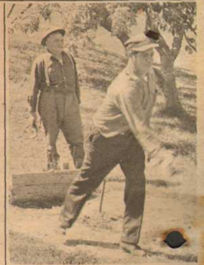
It's summer and while the sun shines the horse-shoes fly.