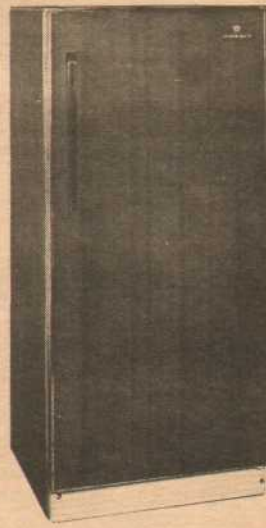
10 CU. FT.

All models can be built in with kitchen cabinetry if the owner so desires.