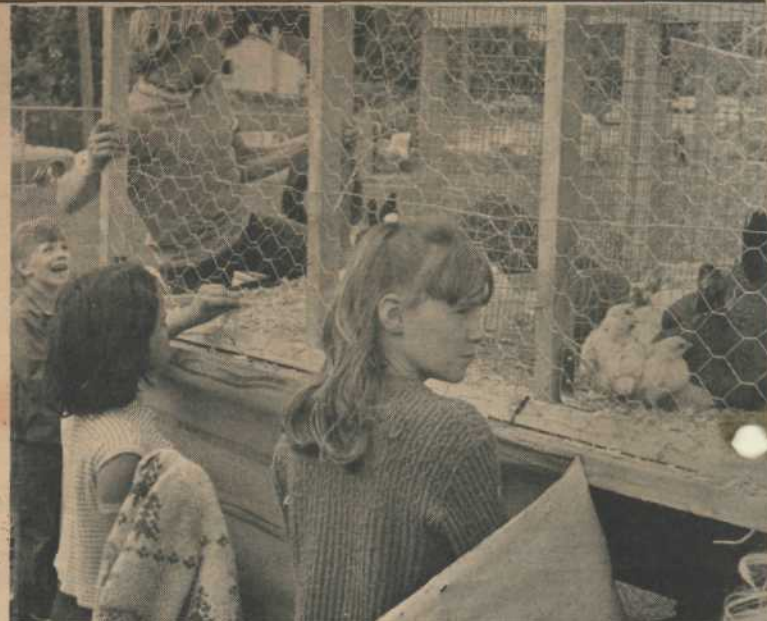
School float at school grounds draws keen student interest.