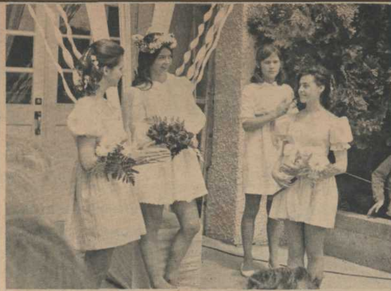
Princesses and two Queens after crowning Saturday at Ganges.

The members decided to accede to the request of the Department of Agriculture to turn back the yearly grant of $10 usually sent to each W.I. to help funds, to the District Board to help carry on official W.I. business, maintain services and so on. The vote taken on this was