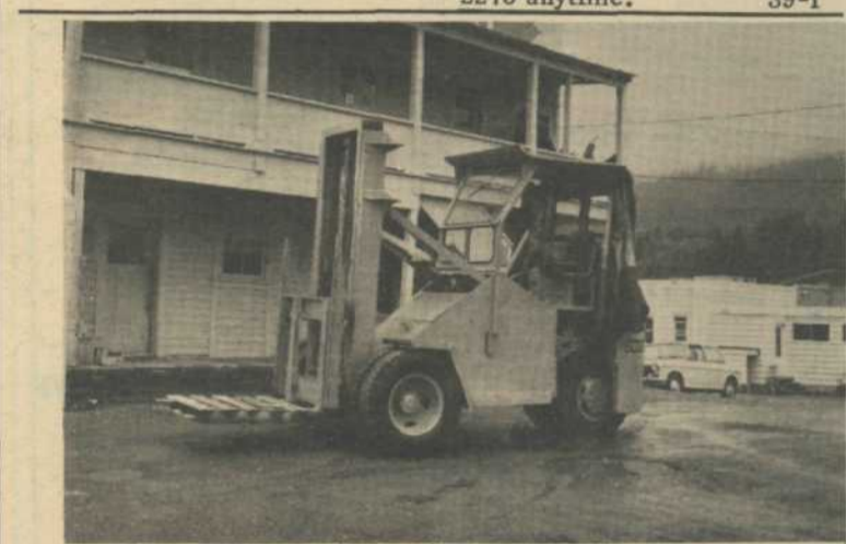
Big fork lift was brought from Vancouver by Mouat's Building Supplies this week. Machine will be used around the company's yard for the easy handling of heavy loads.

A century ago, the Island was inhabited by hostile Indians who called it "Klaathem" in their language meaning - Salt - because of several salt springs, still to be found -- The name translated into English still clings.