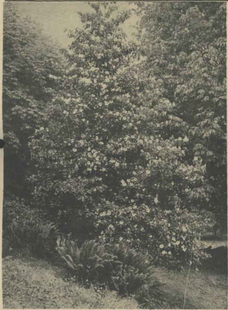
Don't tell anyone, but this is just a mixed-up little Dogwood tree. It is blooming in the fall, when all good dogwood trees lost their flowers long ago. Tree stands in the garden at the home of Mr. and Mrs. L. Bittancourt, Bittancourt Road.