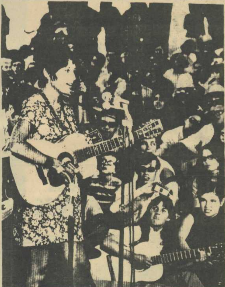
Joan Baez held the audience transfixed when she appeared as the top attraction at this summer's Mariposa Folk Festival on Toronto Island. She is one of many fine artists who will be seen and heard when CBC television presents Mariposa: A Folk Festival, Sunday, Sept. 28 (9:00 - 10:00 p.m. EDT, in color). The hour-long program is an attempt to capture the atmosphere of the festival, not a formally structured concert.