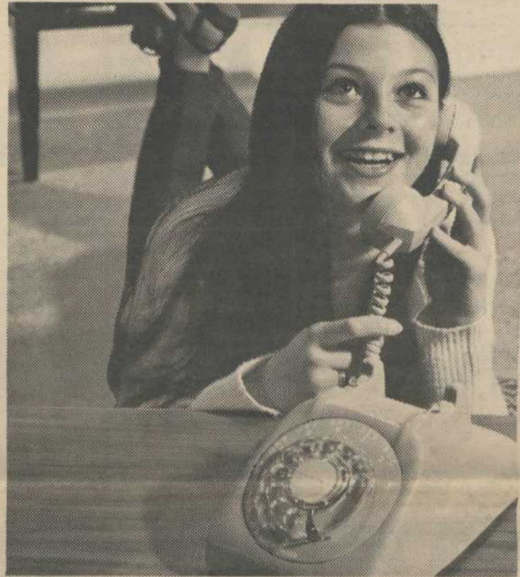
B.C. Tel. part of Trans-Canada Telephone System