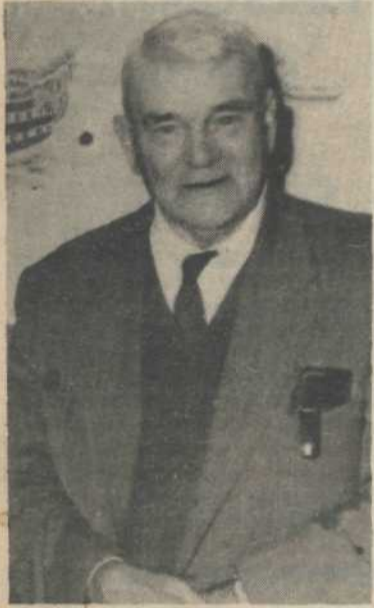
FARMER HERE FOR 50 YEARS