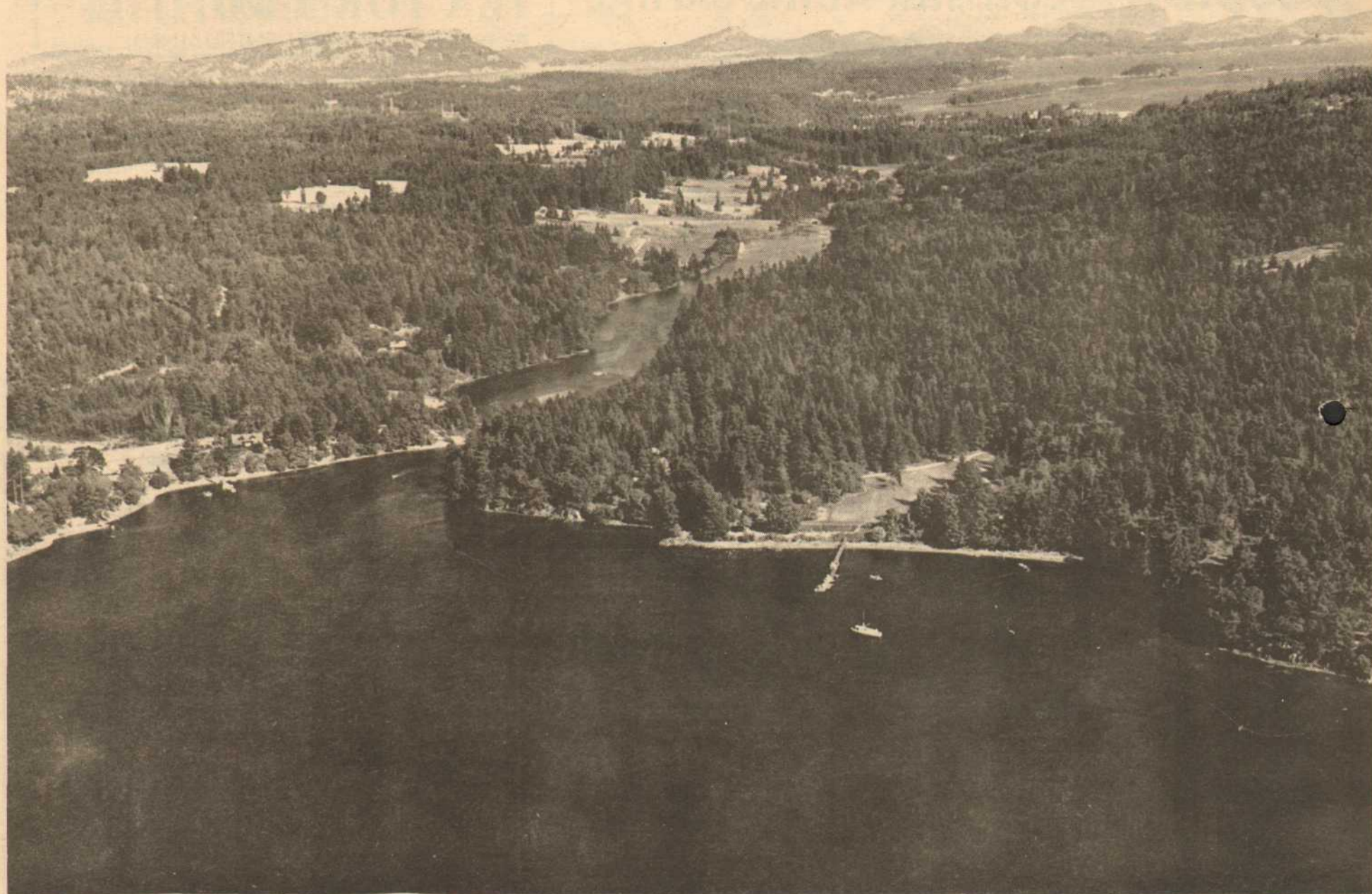
View of Booth Canal from the air