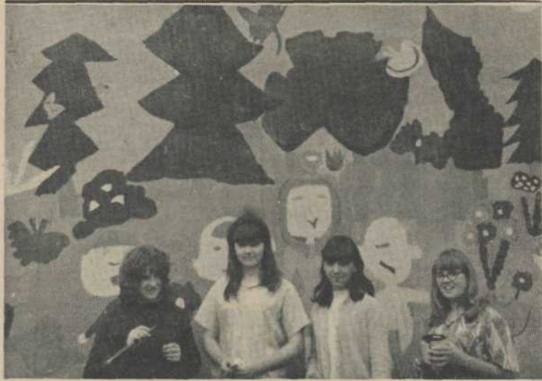
Here are the students and famous Saturna mural.