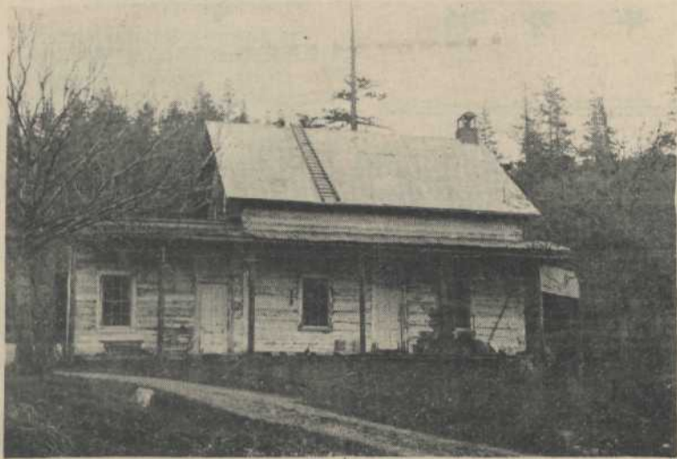
"The Traveller's Rest" as it looked in 1863... Salt Spring's first "Pub" lurked at the rear.