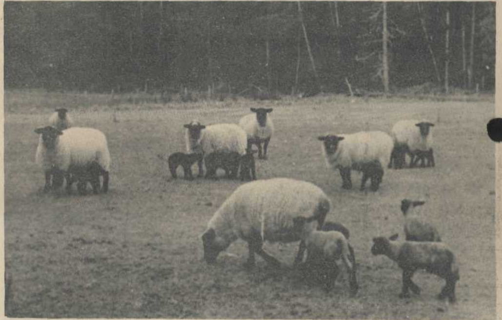
Part of the spring crop of lambs at Valley View Farm showing in the center background a proud mama with triplets.

- JUST ARRIVED - BEGONIA and GLOXINIA TUBERS GULF ISLANDS FLORISTS Ganges, B.C. 537-5751