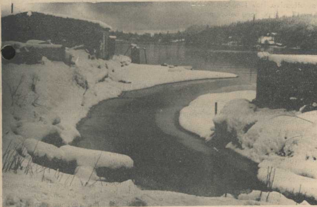
View across the harbour just as the sun began to shine following the Monday night snow storm.