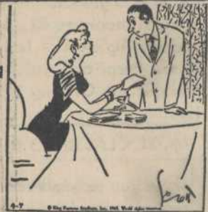
"The only thing the matter with our budget, dear, is your salary."