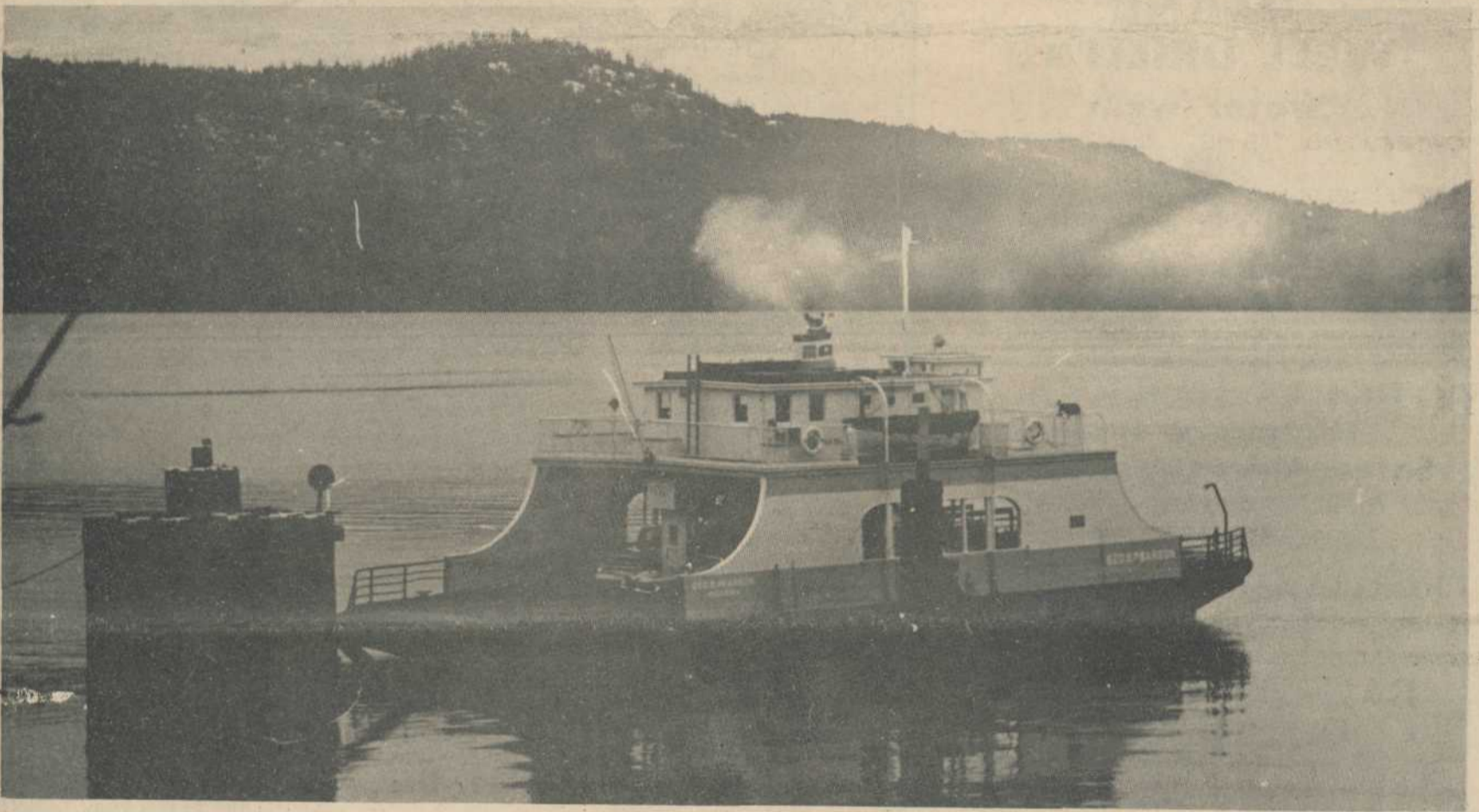
"GEO. S. PEARSON" LEAVES THE VESUVIUS SLIP ON HER LAST DAY OF SERVICE TO SALT SPRING ISLAND.