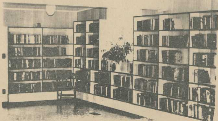
A corner of the new S.S.I. Centennial Library, McPhillips Ave.