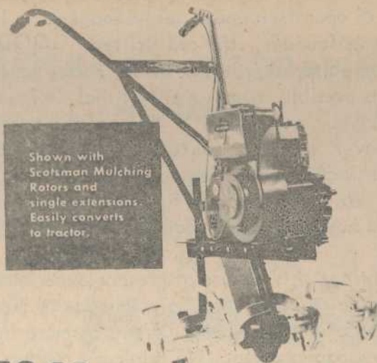
Shown with Scotsman Mulching Rotors and single extensions. Easily converts to tractor.