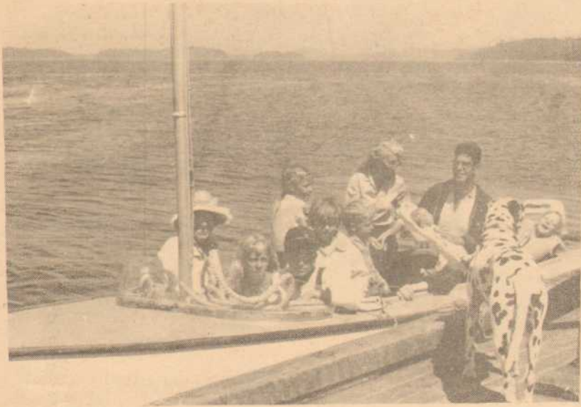
BOAT LOAD of Grasings from China Lake, Calif. and Lunas from Fort Sumner, New Mexico land at Fernwood Wharf after two weeks of fun at their summer home on Hall Island.