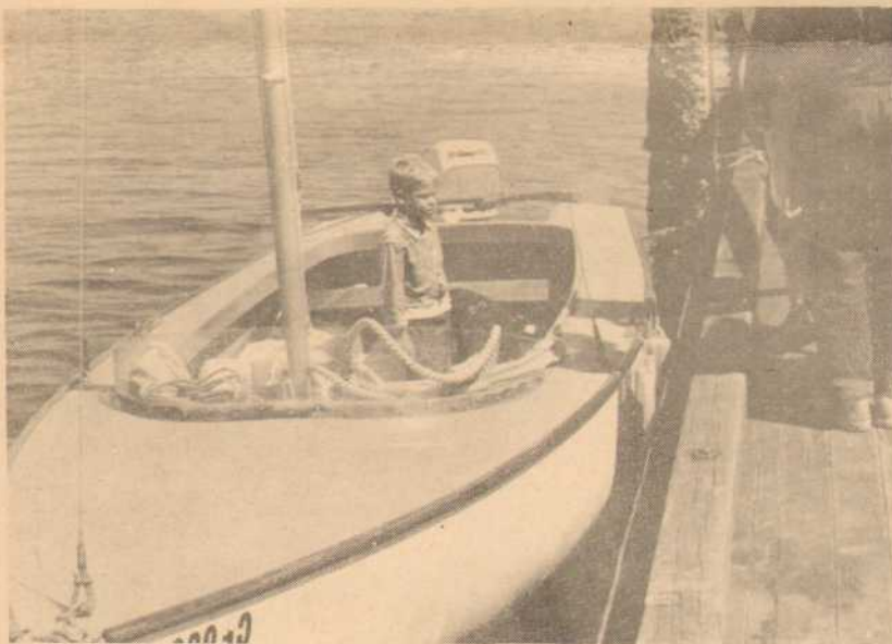
"HEY! Where'd everybody go?" Says Eric.

First game at 10:30 FINALS at 4:00 p.m. To be held in conjunction with Fulford Athletic Club Sports Festival.