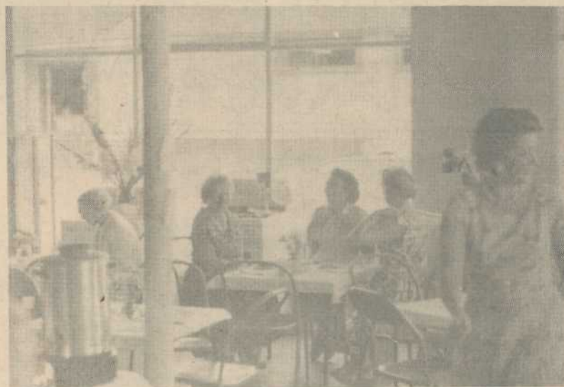
Ladies enjoy OES Coffee and Pie Social at Shell Service Station, Friday, August 7th.

ALEC'S MEAT MARKET on Jackson Avenue PHONE 537-2141 OPEN WEDNESDAY GOVERNMENT INSPECTED MEATS BARBECUE STEAKS 49c lb. GRAIN FED BEEF Friday & Saturday only PLENTY OF PARKING