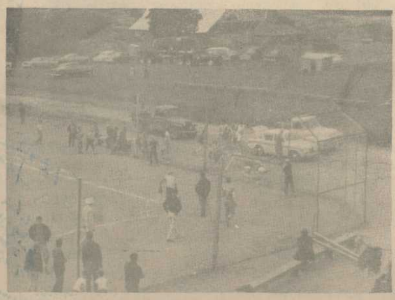
FUN AND GAMES AT THE FULFORD SPORTS DAY